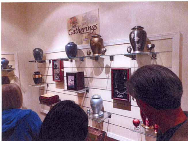
Urns for cremains.