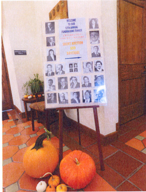
Welcome to our dinner!