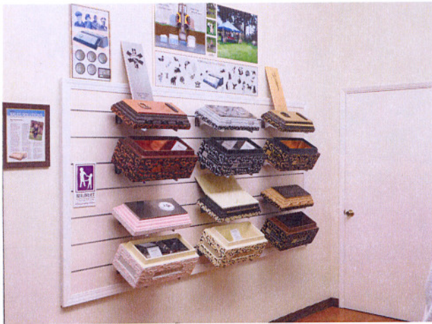
Miniatures of various vaults.