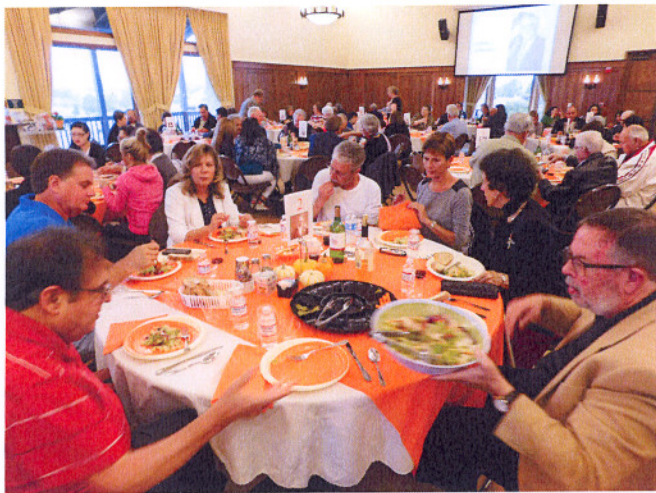
Delicious food and good company