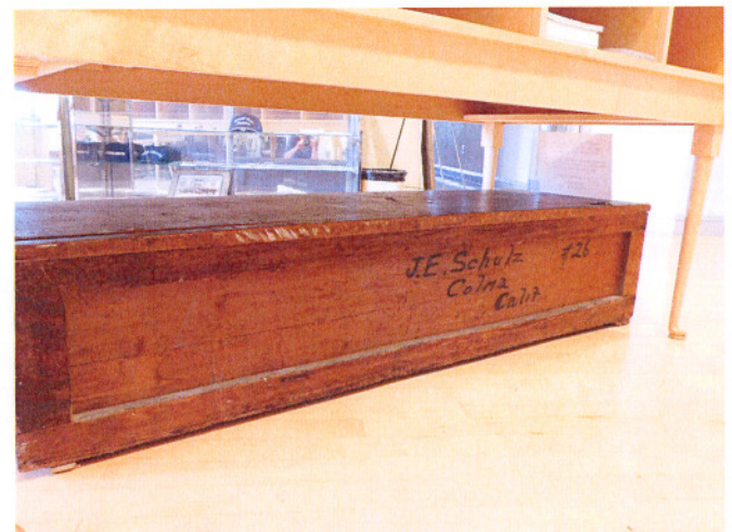
Body transport box