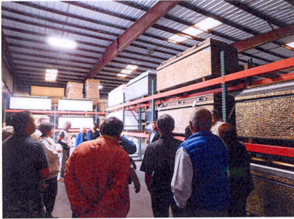
Visiting the factory.