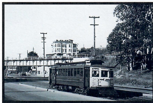
#40 Streetcar, Railroad bridge across Mission St., and the Bocci Monuments office & home up on the hill.

*Tip: If you don't have a lot of time, watch Part 4.